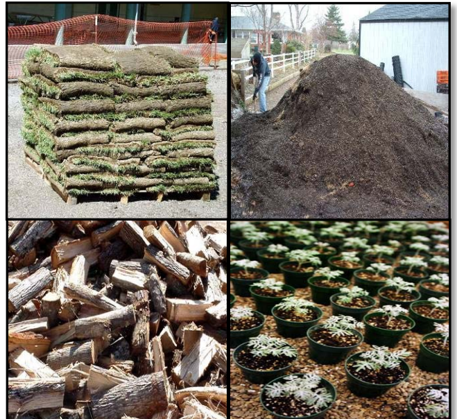
Red Imported Fire Ant Prevention. RIFA can easily be spread from one location to another by "hitching" rides on materials such as: sod, soil, firewood and nursery stock. Carefully inspect these materials for the presence of RIFA.

Baits in the form of broadcast granular products are very effective and can give very high levels of control. Baits are designed to attract foraging RIFA who pick up the bait and carry it back to the nest where it will be consumed and either kill the queen or render her sterile. EPA registered active ingredients for RIFA control include methoprene, abamectin, hydromethalon and fenoxycarb. Individuals applying any treatment should read product labels carefully and follow all directions. Although baits are slow-acting, their use is often the best way to reach the queen and eliminate the colony.