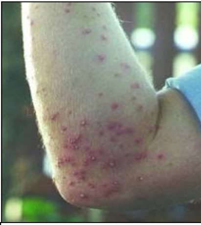
Skin Reaction to Multiple Red Imported Fire Ant Stings. Unlike bees, RIFA can sting multiple times. Avoid scratching these blisters to prevent bacterial infection and